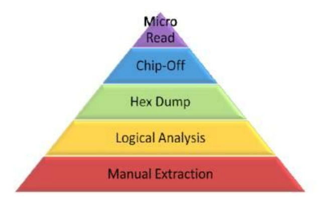
FIGURE 1: Mobile Tools Classification System [15].

The Manual Extraction method involves viewing and recording the data content stored on a smartphone device. This method cannot recover deleted information but can provide a record of various screens and the user interface. This is a time-consuming process and depends on the device working condition.