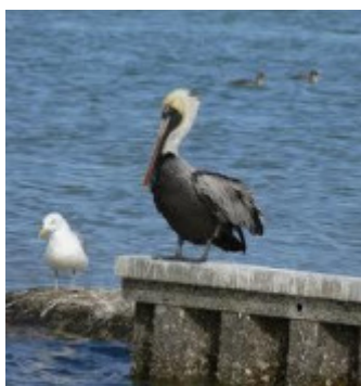
Figure 3: Sample image