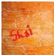
Figure1: Damaged image Considered as image1.

Figure 3 is considered as a sample image for object duplication. Images of figure 4 (a), (b), (c) are the inpainted images using poisson editing, multiscale transformation and Shepard’s method respectively for manipulation in a sample image with duplicated small bird which is seamless.