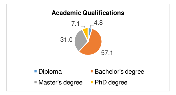
FIGURE 4: Responses on Academic Qualifications.

An analysis was conducted of respondents' academic qualifications. The findings indicated that 4.8% of the respondents had a Diploma, 57.1% of the respondents had a Bachelor's degree, 31% had a Master's degree and 7.1% had a Ph.D. degree. Two respondents with Diploma academic qualifications had five years of experience in developing python applications and three years experience in software modelling and estimation hence were considered as experts. Findings on academic qualifications are presented in figure 4.