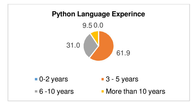
FIGURE 3: Responses on Python Language Experience.

Analysis of respondent's responses on python language experience was conducted and the findings indicated that none had less than three years experience. 61.9% had three to five years experience, 31% was in the category of six to ten years experience and 9.5% had over ten years experience with python applications. The findings were a clear indicator that the respondents were qualified to participate in the study and would provide reliable information. Findings are presented in figure 3.