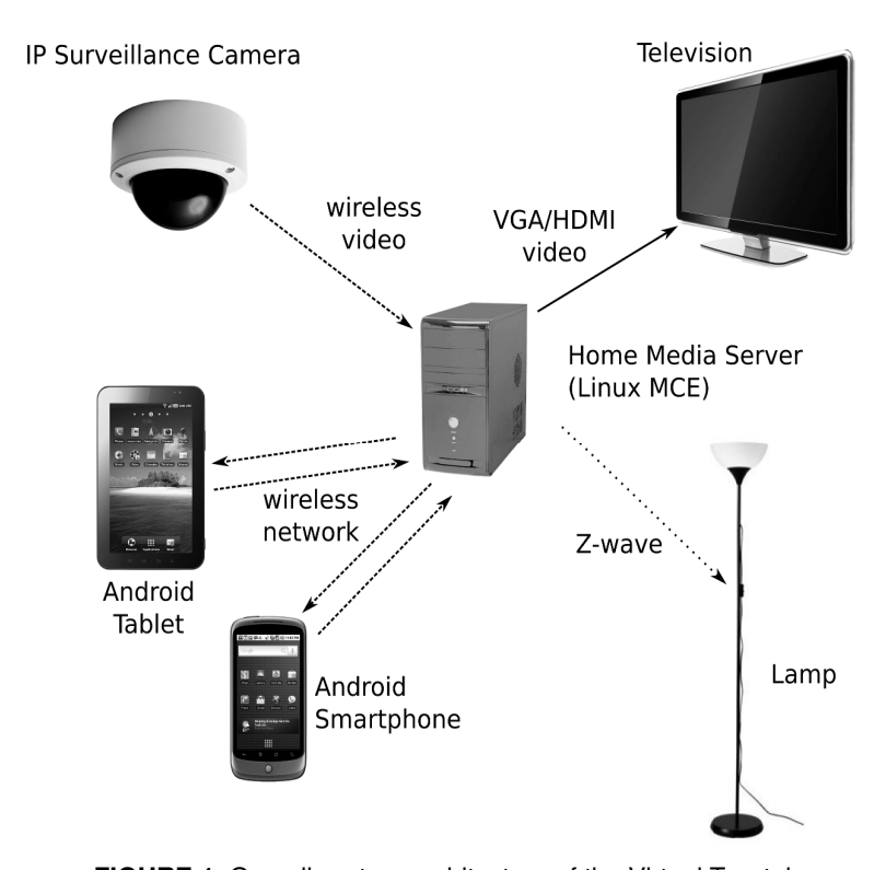
FIGURE 1: Overall system architecture of the Virtual Teratak

The overall system architecture of Virtual Teratak is presented in Figure 1. The objective of this system is to enable the home users to control their home appliances in a more convenient and intuitive manner using smartphones or tablets. A home media server known as LinuxMCE is used in the system to provide the services of controlling and monitoring various home appliances connected through a wireless setting. Various movies are stored in the home media server itself, which is directly connected to a TV on the initial prototype. Other home appliances (lamps, fans, etc.) are each connected to a Z-wave receiver and communicate over radio frequency at the 908MHz band with a Z-wave transmitter that is connected to the home media server. Devices that support Internet Protocol (IP), e.g. the IP surveillance camera, would be accessed directly through the home network (refer to Figure 2). Customized home control applications were developed to allow users to control home appliances on Android phones and standard PCs.