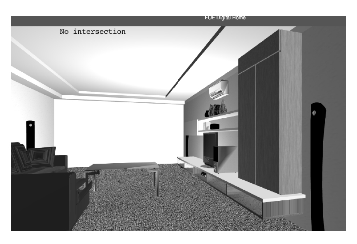
FIGURE 4: 3D Virtual Home of the Virtual Teratak