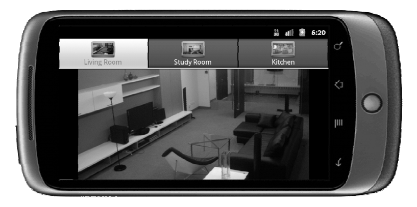
FIGURE 3: Augmented Photo Interface of the Virtual Teratak