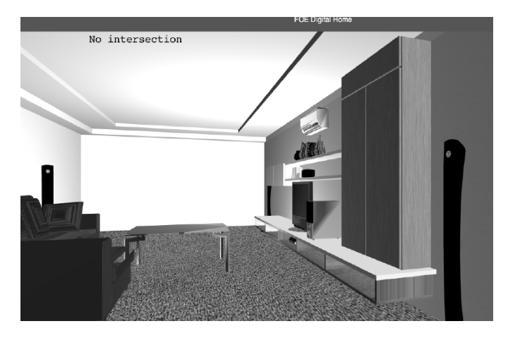
FIGURE 4: 3D Virtual Home of the Virtual Teratak