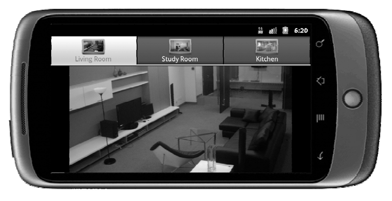
FIGURE 3: Augmented Photo Interface of the Virtual Teratak