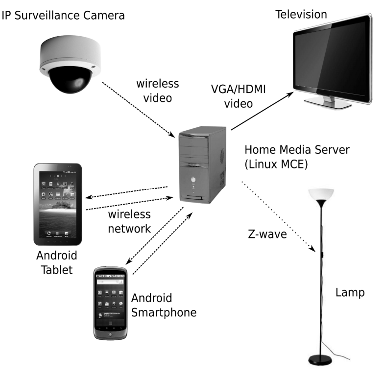
FIGURE 1: Overall system architecture of the Virtual Teratak

The overall system architecture of Virtual Teratak is presented in Figure 1. The objective of this system is to enable the home users to control their home appliances in a more convenient and intuitive manner using smartphones or tablets. A home media server known as LinuxMCE is used in the system to provide the services of controlling and monitoring various home appliances connected through a wireless setting. Various movies are stored in the home media server itself, which is directly connected to a TV on the initial prototype. Other home appliances (lamps, fans, etc.) are each connected to a Z-wave receiver and communicate over radio frequency at the 908MHz band with a Z-wave transmitter that is connected to the home media server. Devices that support Internet Protocol (IP), e.g. the IP surveillance camera, would be accessed directly through the home network (refer to Figure 2). Customized home control applications were developed to allow users to control home appliances on Android phones and standard PCs.