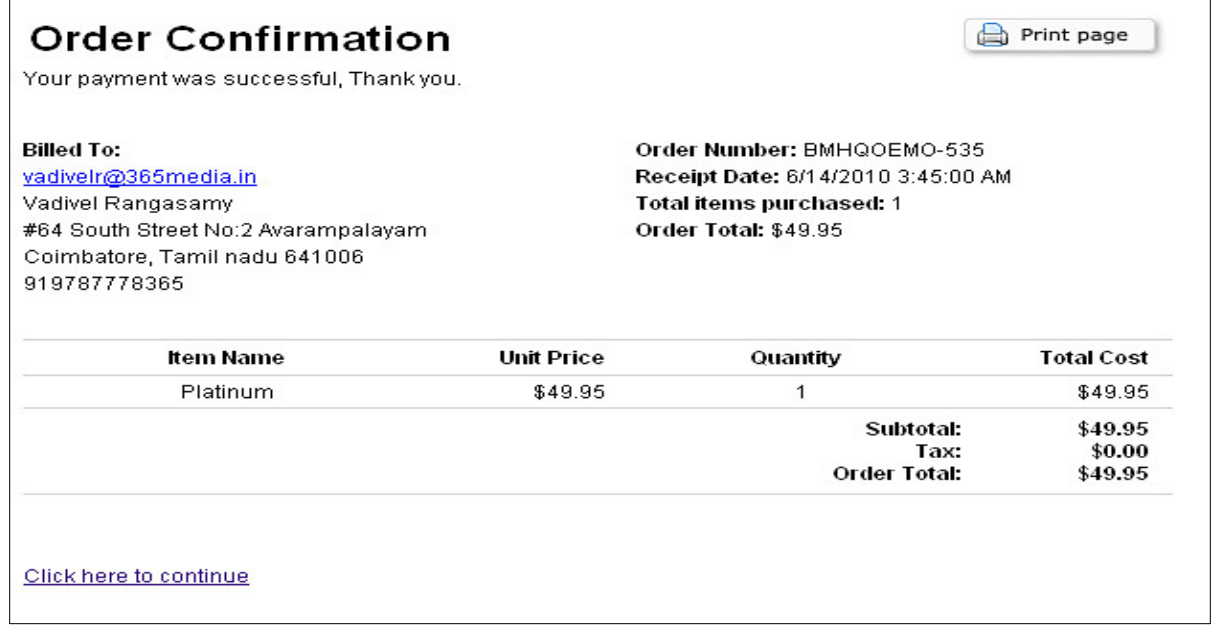
FIGURE 3: Order confirmation page