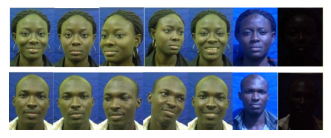
FIGURE 1: Examples of images in the face recognition database

Part B of the database contains two folders, 'detect' and 'recognition' folders. The 'detect' folder contains two folders, one contains images captured under good illumination ('Light') while the other contains images captured under poor illumination ("Dark'). The light folder has 50 images which contain at least 72 human faces of varying poses and illumination captured under good lighting condition. Few images were adopted from the internet one or two existing databases. The dark folder has 50 images which contain at least 68 human faces of varying poses and orientations taken under poor illumination. A summary is given in Table 3 and examples of images captured under good and poor illuminations are shown in Figures 2a and 2b respectively.