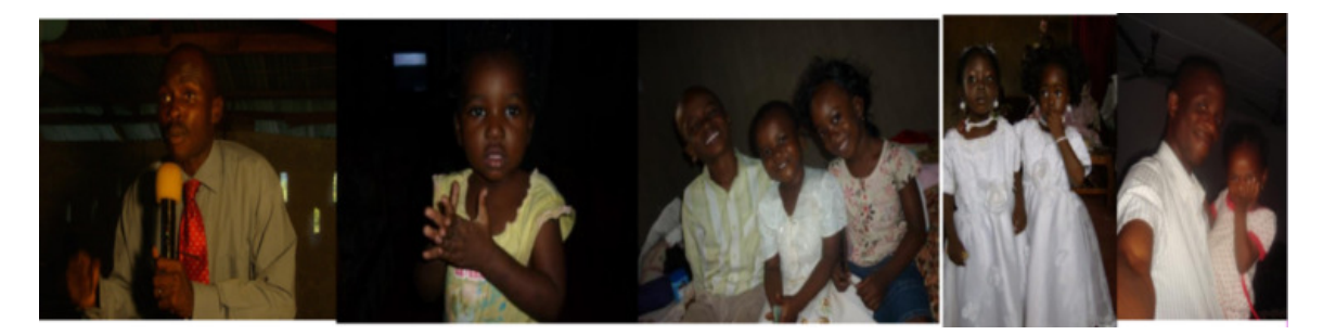
(a) Images taken under poor illumination FIGURE 2: Examples of images in the face detection database