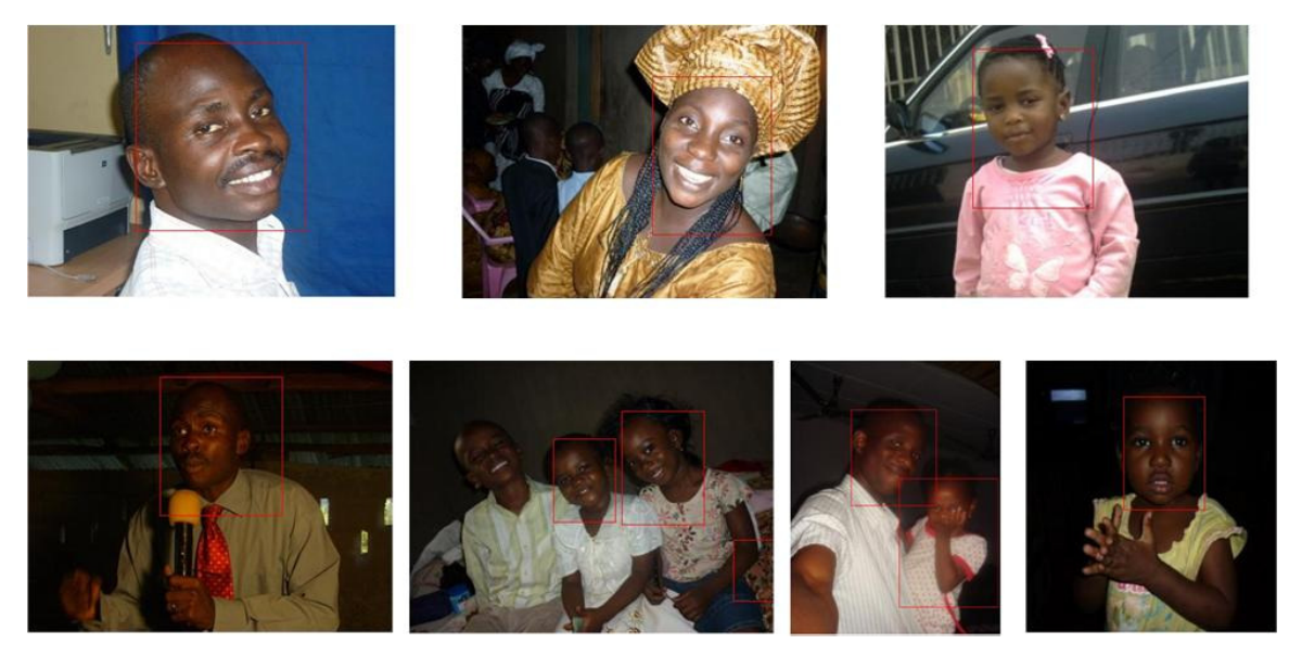
FIGURE 6: Selected images from the database showing detected faces.

Images in the face detection subfolder were tested for presence of faces using a novel face detection algorithm [16]. Some of ths results are shown in Figure 6. Detection rates of 83.8% and 76.4% were achieved for faces captured under good and poor illumination respectively. The same images were tested with earlier algorithms which have been reported to have good performances [17,18], details shown in Table 5. It is observed that although the earlier algorithms performed excellently well when benchmarked on some face detection databases, it was not so with the new database (BFDB). As a result, the new database with its unique feature of large variations under real life situations is expected create new frontiers for researches in face detection and recognition.