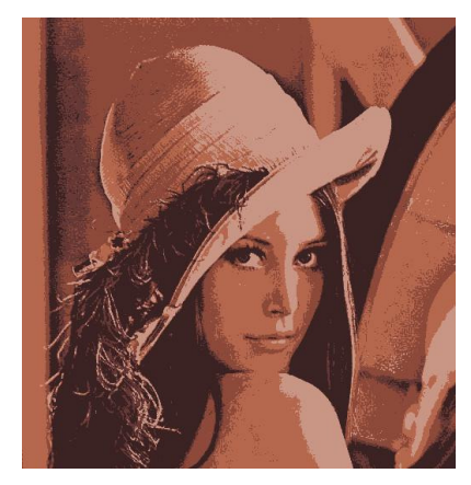
Segmented image by proposed method

FIGURE 1: Experimental results of some natural images