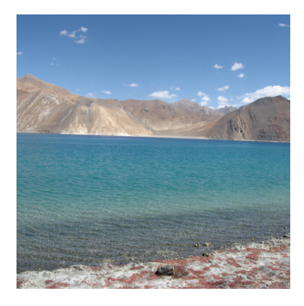
Table 1: Experiment of some natural images